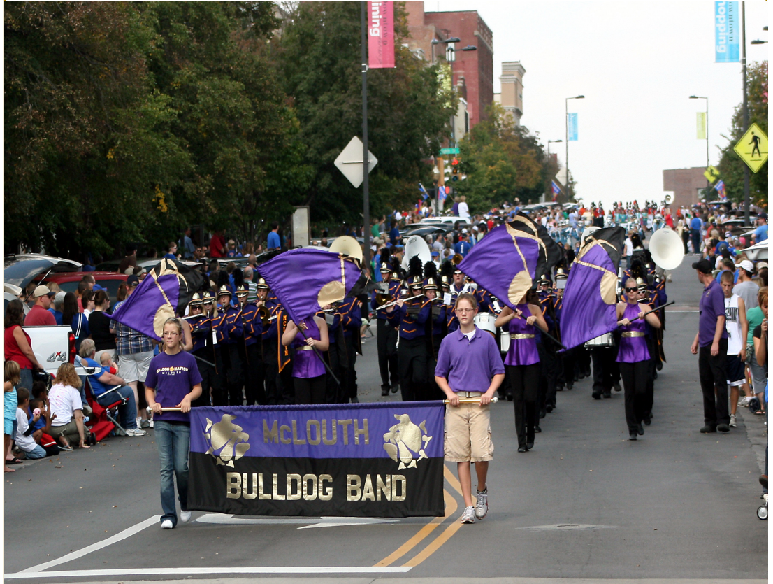
The MHS band at the KU Band Day parade in Lawrence Kansas.